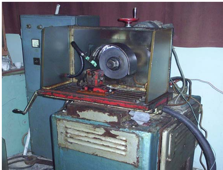
Figure 3. Complex erosion equipment

By analyzing the technological system during complex, electrical and electrochemical erosion processing (fig.3), the paper establishes a systemic model of this technological process.